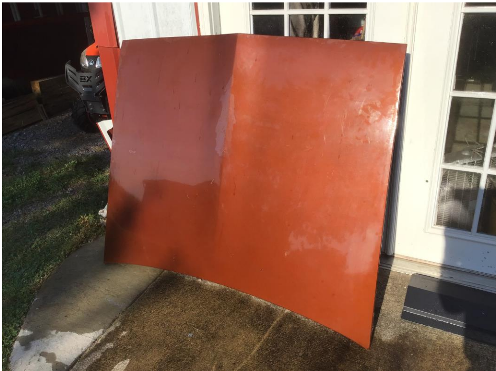
1973-1976 Dodge Dart Hood. $125.00 OBO.