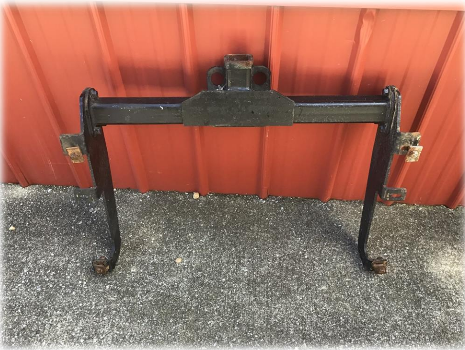
1985 Ramcharger Trailer Hitch. $40.00 OBO