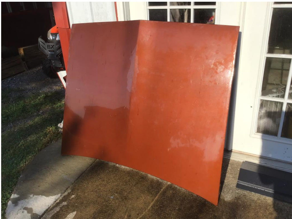
1973-1976 Dodge Dart Hood. $125.00 OBO.