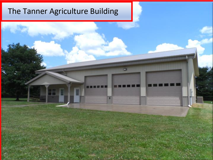
The Tanner Agriculture Building