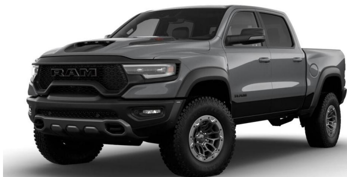
2021 Ram hemi