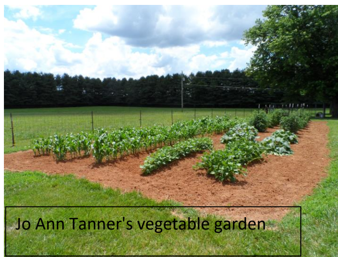
Jo Ann Tanner's vegetable garden