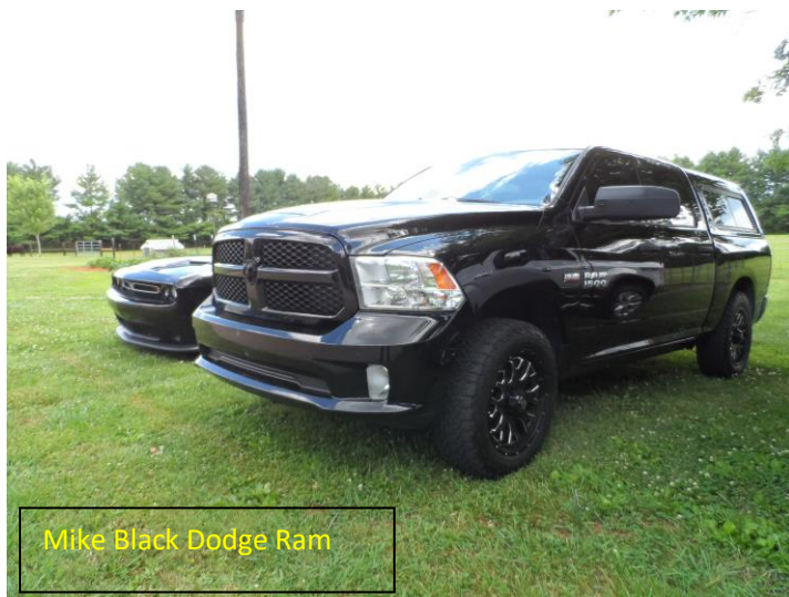
Mike Black Dodge Ram