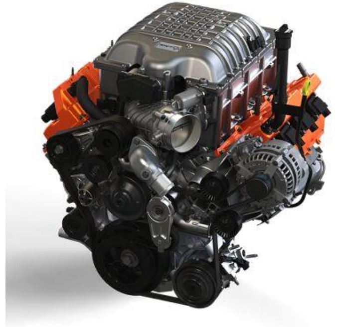
6.2L supercharged hemi