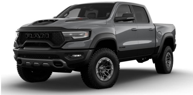
2021 Ram hemi