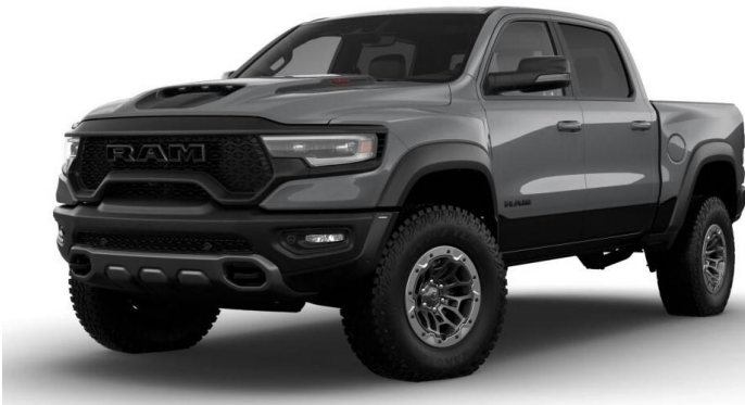
2021 Ram hemi