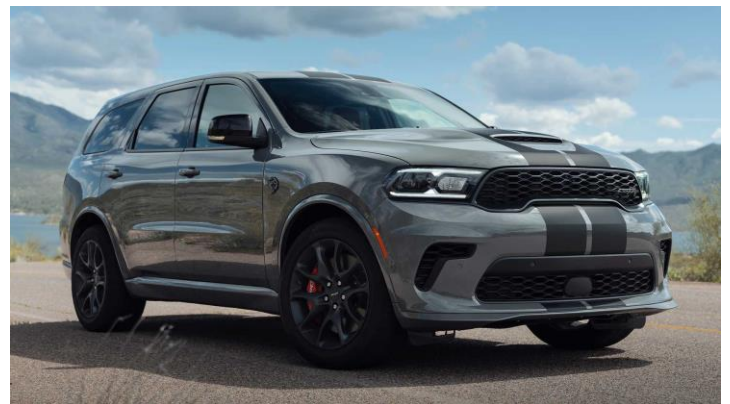
2021 Dodge Durango SRT