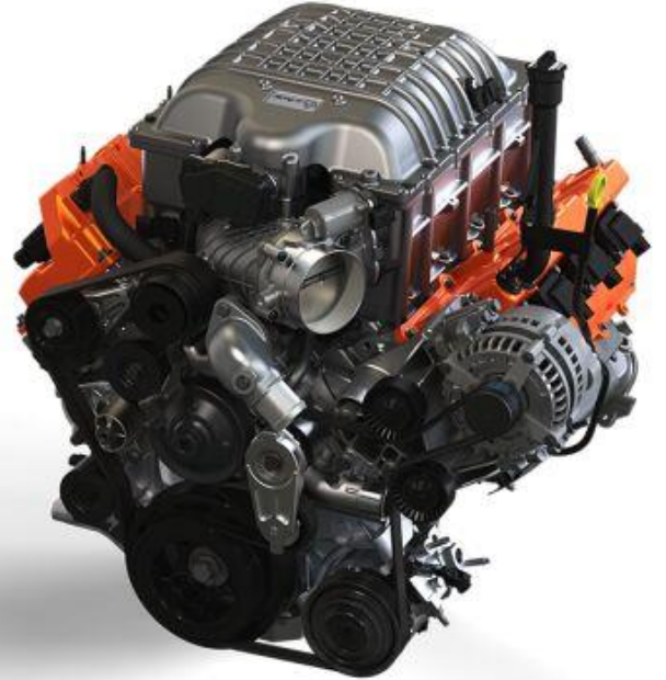
6.2L supercharged hemi