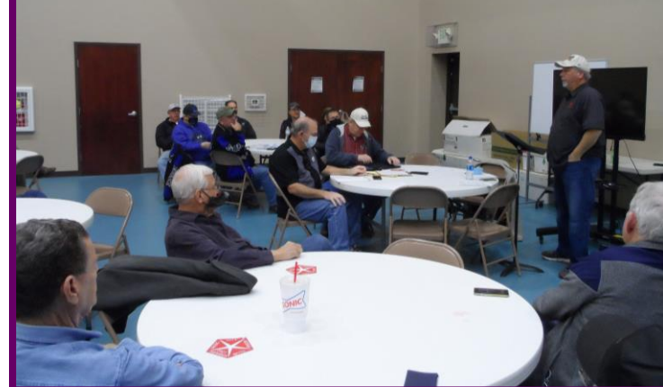
Members practiced “social distancing” and wore masks.

We voted to go with the show theme proposed by the officers of “Keep on Truckin” highlighting Trucks, Vans, and SUVs. We discussed how well last year’s show went and our goal is to keep on improving by doing what we do best: Family friendly, well organized Car Show, with the most comprehensive