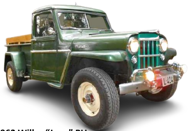
1962 Willys "Jeep" PU