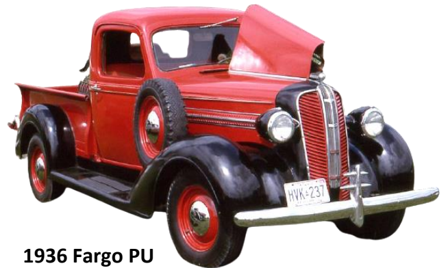
1936 Fargo PU

Some possible vehicles to participate in our 32 nd Annual Show in September: