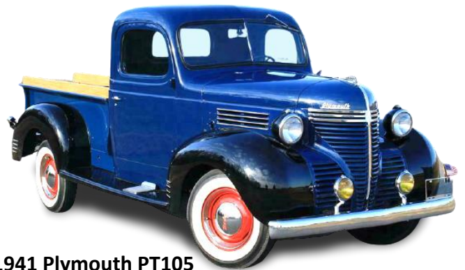
1941 Plymouth PT105