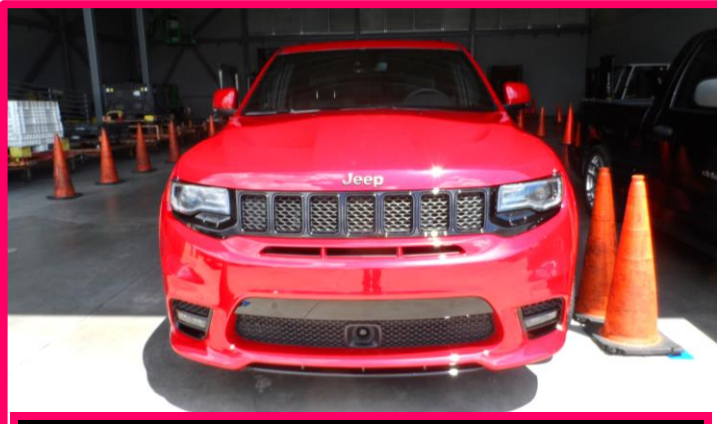
A couple of new rides were in the fenced parking area