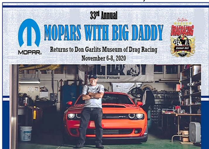
The 33 rd Annual Mopars With Big Daddy will be held at the Don Garlits Museum of Drag Racing in Ocala, FL. Details will be available

soon. More information is available on FB page: www.facebook.com/events/969876703379901/