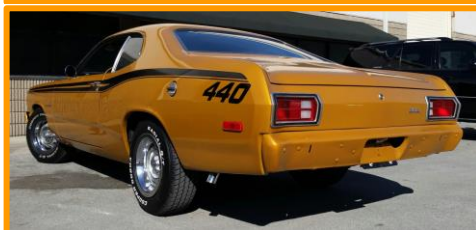
1973 Plymouth Duster - Gold Duster option - Gold w/ Gold & Black interior - 400ci w/ column shift automatic transmission, engine rebuilt by Mopar pro Tony DeFeo in winter

2018 - 20k miles showing, true mileage unknown - Space Duster option -Very Good to Excellent condition cosmetically and mechanically with No Rust. New Legendary interior in matching original style. Extremely clean and drives great! Service Manual plus multiple keys and additional toys and parts included. Asking $24,000, will consider offers but no trades please, thanks for looking! Contact Marc / Nashville, TN at 917-691-5372 or email union_inc@hotmail.com .