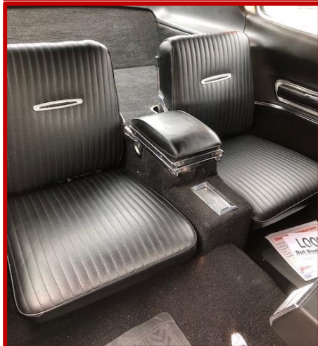
1967 Dodge Charger, Unrestored, Numbers Matching 383 automatic,

Power Steering, Factory Air. 107K miles. $22k obo. Call or text Billy at 256-335-2001.