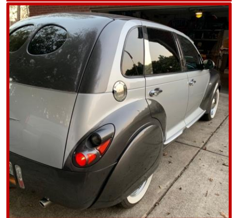
2004 Chrysler PT Cruiser Rte 66 Edition, 1 of 1 custom, 43000 miles. Custom upholstery, side skirts, fenders, front grill, windshield visor, rear split window, special two tone paintwork, chromed and hydro