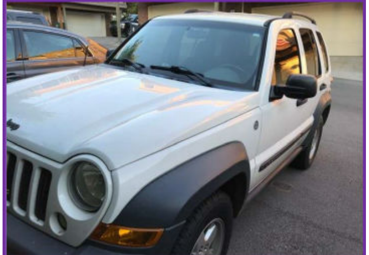
2006 Jeep Liberty Sport(4wd)