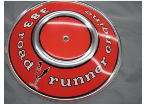
383 Roadrunner air cleaner cap in excellent condition $20

New set of repro pistol grip shift grips - lost the screws. $25 obo