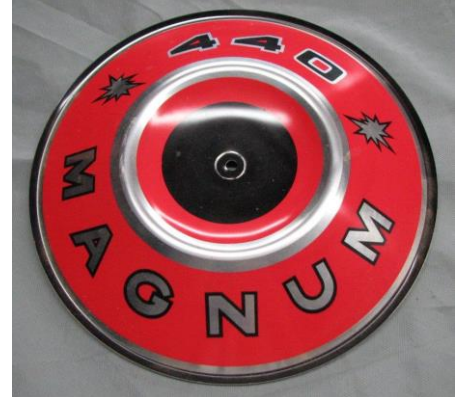
440 Magnum cleaner cap in excellent condition $20.