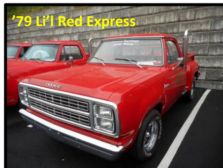
'79 Li'l Red Express