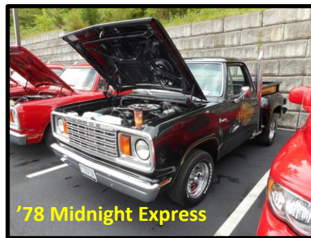
'78 Midnight Express