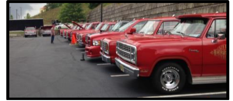
The following pics: 2003 Custom Built SEMA Modern Li'l Red Express