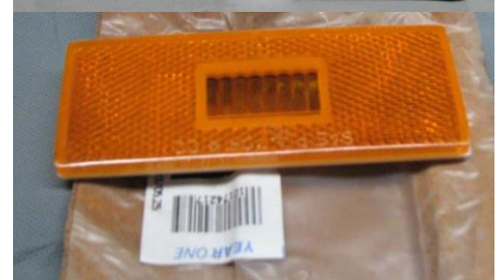
Set of front side marker lights and backing plates for 69-70 B-Body and maybe others. Will clean-up nice $25.00 OBO. Also new front marker lense for 69-70 B-Body $10.00

{More items from same seller on next page}