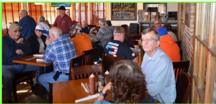
THE CLUB MEETING BEGINS: