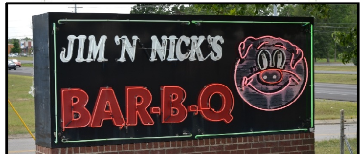
November meeting at Jim & Nick's BBQ, Smyrna.