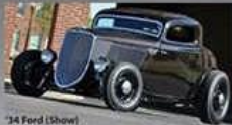
'34 Ford (Show)