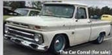
The Car Corral (for sale)