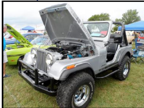
Best of Show Stock Monty Slaughter- 1979 Jeep CJ5 Silver Anniversary