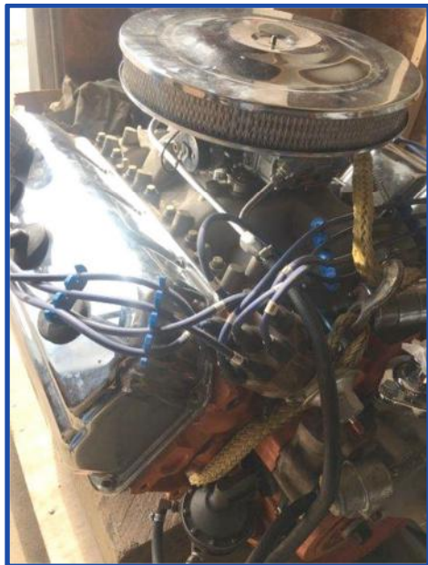
For Sale: 426 Hemi – 472 Crate Hemi -

1965 Plymouth Sport Fury Asking $3500. For more info call 931-626-6797.