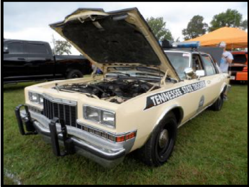
Dealer's Choice Jerre Reimers- 1970 Chrysler Newport