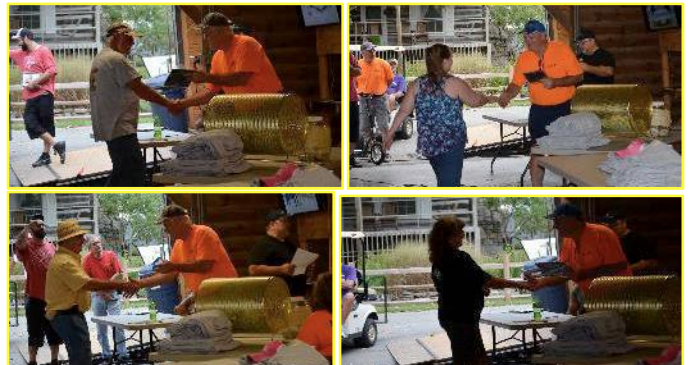
End of Day: Awards Presentation