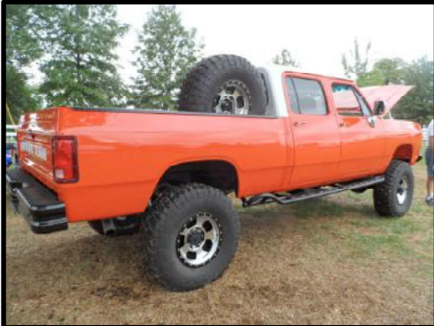
President's Choice Truck Glenn Hibbert- 1980 Dodge W200