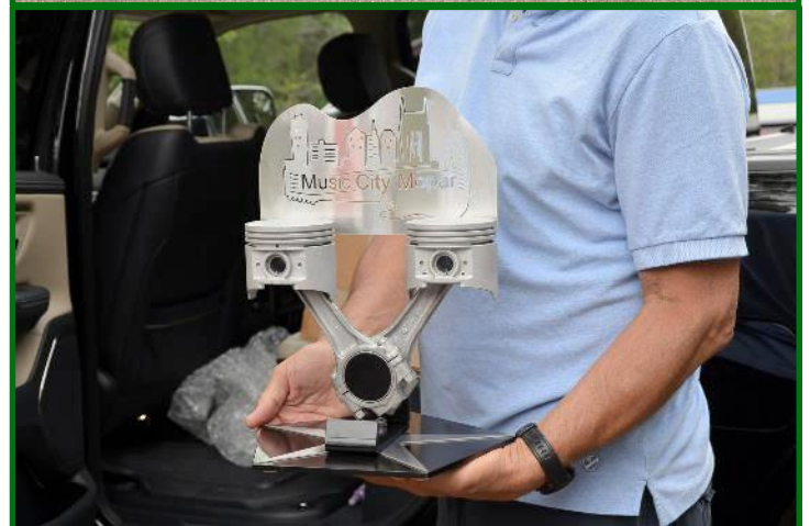
Best in Show trophies ~ Provider Don Wolfe.