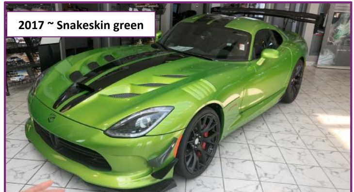
2017 ~ Snakeskin green