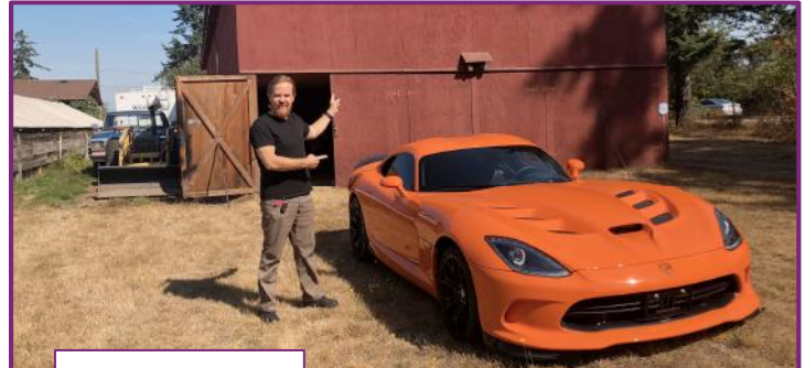
2017 TA Orange

From Canada: Vipers, plus a Barn Find (sort of) by Lars: