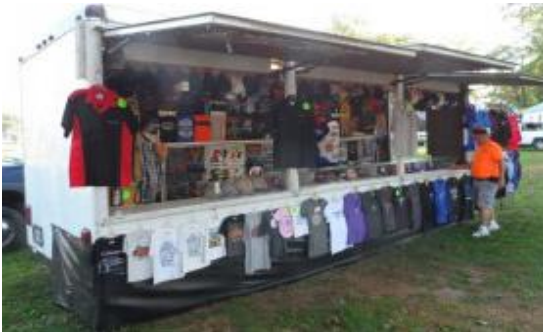
Many Vendors selling Mopar items