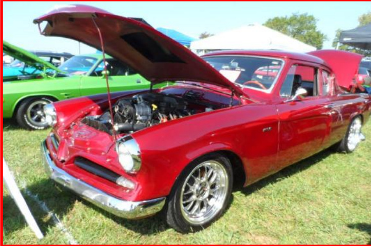
Mopar HEMI powered 1953 Studebaker:

More pictures from the 28 th Show {on and off the Show Field} can be viewed at the Club's website, www.musiccitymoparclub.com