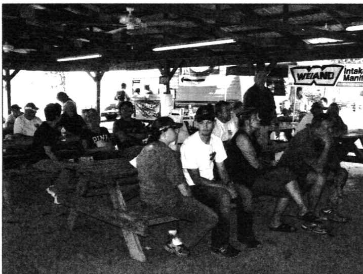
Is it Trophy Time Yet?