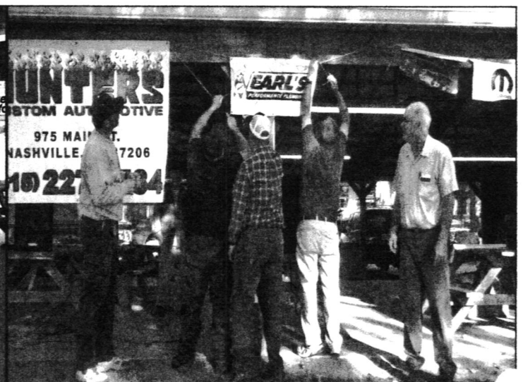
How Many Mopar Club Members does it take to put up a Small Sign?