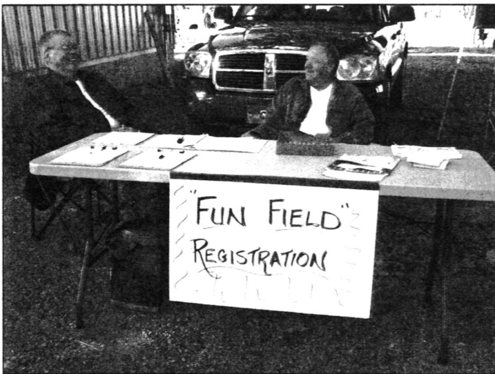
What did you say we are supposed to be doing?

See you at Oktoberfest, and drive those Mopars!