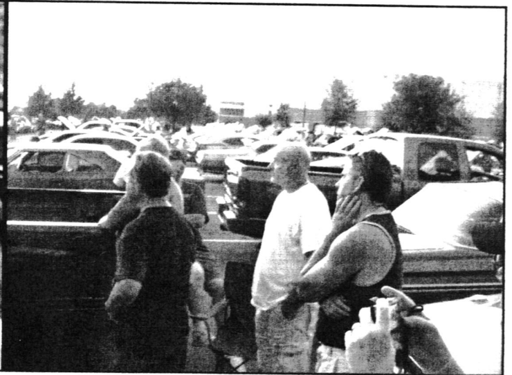
Look at all those Mopars, and there are many more!