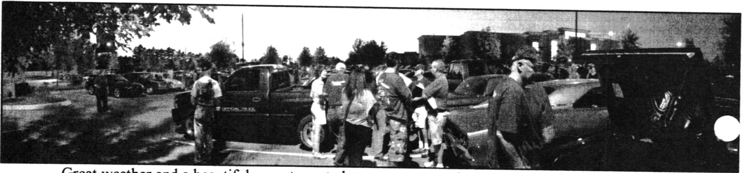
Great weather and a beautiful sunset greeted everyone at our August meeting in Murfreesboro.

We still need items for our goodie bags. One way to help is by working with your local business, the ones' you trade with often, to secure door prizes and goody bag stuffers. Don't be afraid to ask your local businesses, many are willing to help us, if we just ask! Don't forget, you can also volunteer to help during the show. We will need help with setup, registration, parking, vendors, judging, tear down, and much more. Remember, the more people involved, the easier it is on everyone!