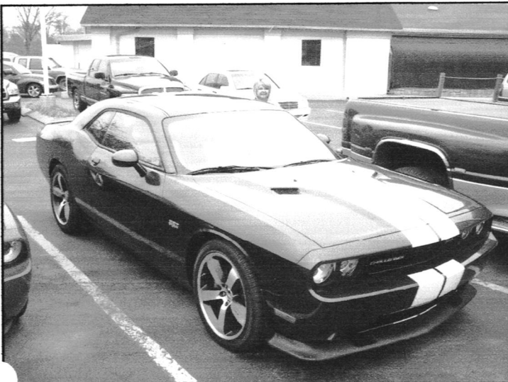
I DON'T CARE WHAT HE SAYS.... It's mine, all mine!