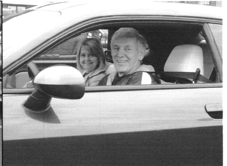
No really, I bought it because it nearly matches my UK jacket!