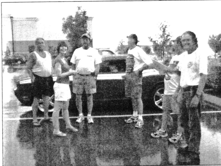
Just standing in the rain!