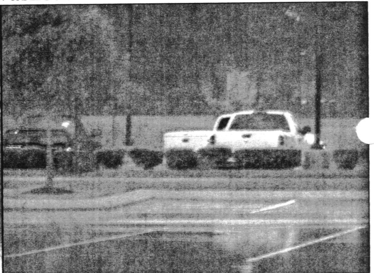
Leaving a big empty lot in the rain!