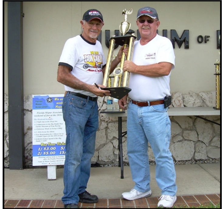
PICTURES OF AWARD WINNERS @ DON GARLITS SHOW, OCALA, FLORIDA; NOVEMBER 7 AND 8: