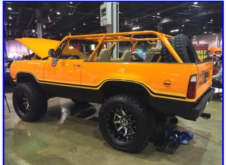
Lars Skroder sent the following pictures from MCACN in Rosemont (near Chicago), IL on November 21 & 22, 2015: