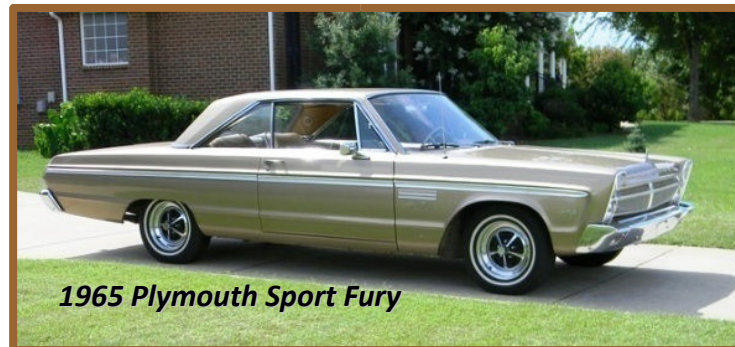
1965 Plymouth Sport Fury

For Sale: 1967 Plymouth Satellite, 383 cid, AT, 4.10 Dana - cut down 2', new brake and gas lines, gas tank, shocks and rear springs, new floor pan, frame tied, plus 426 Wedge block, Ross pistons - Melling Oil pump, Total seal rings - Comp springs and lifters, Clevite coated rod bearings - 540 Comp cam, ARP head and rod bolts, Water pump & housing - Manley 2.14 & 1.81 valves, 3,000 stall converter - 8 qt. Pan & Pickup and more parts not listed ~ $8500.00 OBO for all. Call James ~ 615-403-7454 or 615-876-3341