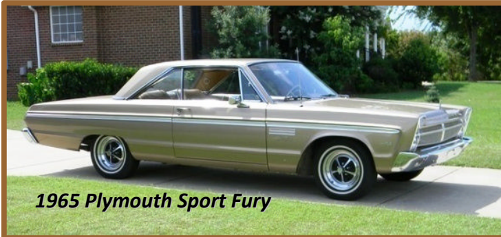
1965 Plymouth Sport Fury

For Sale: 1965 Plymouth Sport Fury, this is a very nice driver powered by a 383 V8 with a automatic transmission. This beauty is gold on gold and has a great paint job; interior is in good shape but could use a little TLC. I have many spare parts for the car including the factory fender skirts. This car has been one of the more fun cars I have ever owned, so please feel free to contact me with any questions or to set up a time to come take a look at it. $15,000 obo {special price for Club Members ~ call for details ~ robertalan.jackson@yahoo.com or 615-478-5534}