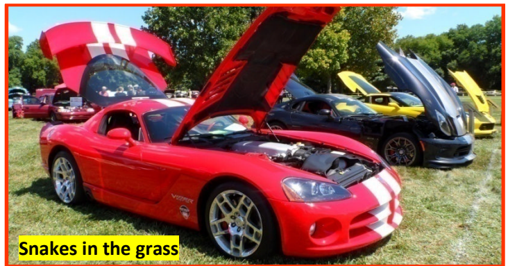
Snakes in the grass