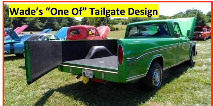
Wade's "One Of" Tailgate Design