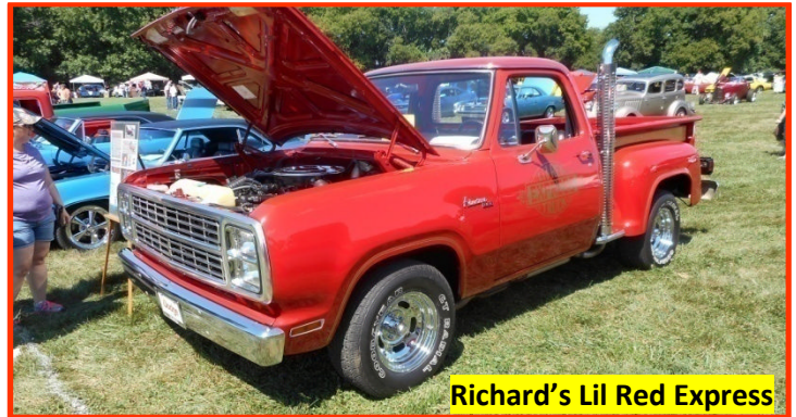
Richard's Lil Red Express