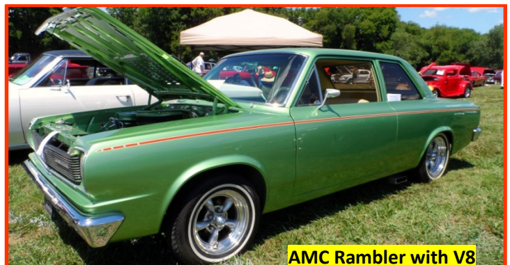
AMC Rambler with V8