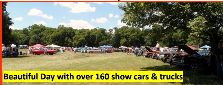
Beautiful Day with over 160 show cars & trucks