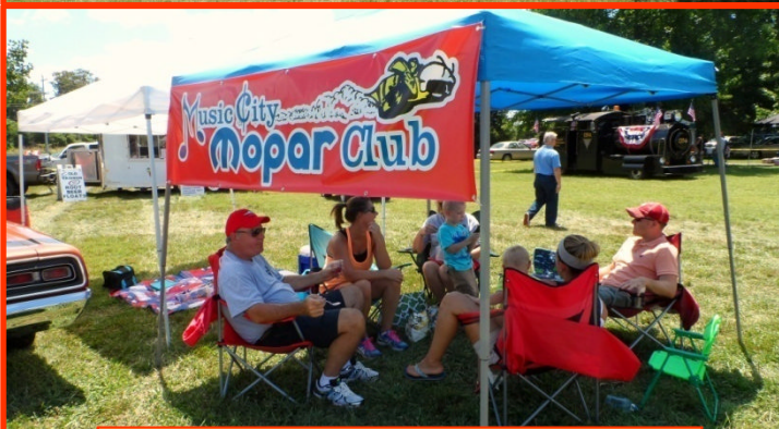
Make shade or find shade