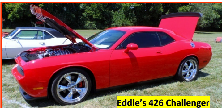
Eddie's 426 Challenger