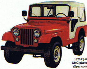
1976 CJ-5 AMC