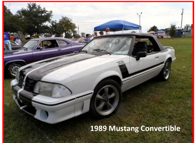
1989 Mustang Convertible

09-28-14: On Sunday the Music City Mopar Club held its first 25~50~100 Open Show to celebrate 25 years of the 1989 model year vehicles, 50 years of the Ford Mustang, 50 years of the 426 Hemi and 100 years of the Dodge brand. Participants voted for the cars and trucks in each category and trophies were awarded that afternoon.