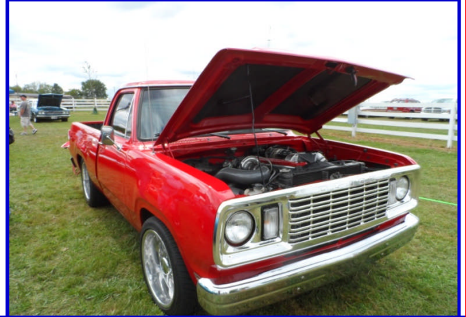
WOW: A '77 D150 Regular Cab Short Bed with a Hummin' Cummings Turbo-Diesel under the hood.