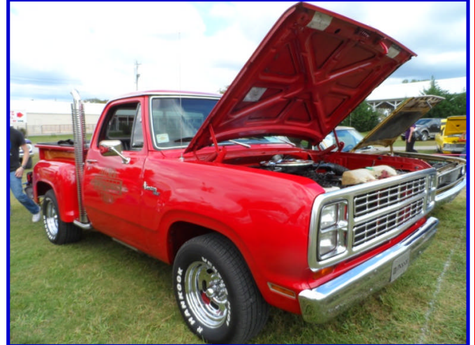
A few pictures are shown here. Check out the Music City Mopar Club's website and Facebook for more photos.