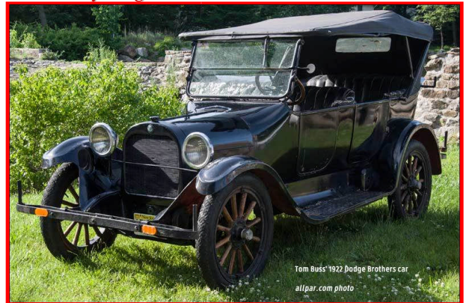
Tom Buiss' 1922 Dodge Brothers car

A recent press release stated, "With the purification of the brand and consolidation with SRT, Dodge is getting back to its performance roots with every single model it offers."