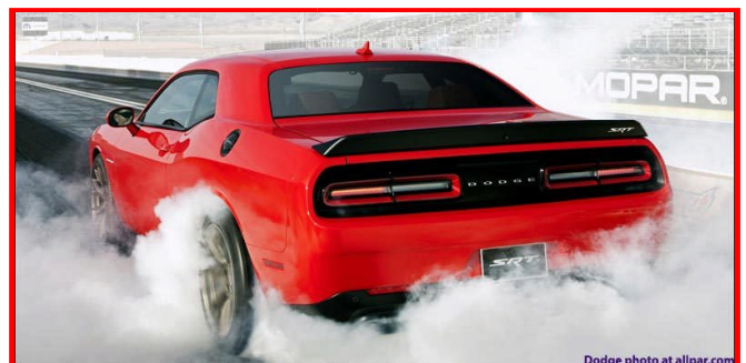
Dodge photo at allpar.com

The press release continued, "Dodge is the 'mainstream performance' brand ... SRT is positioned as the "ultimate performance" halo..."