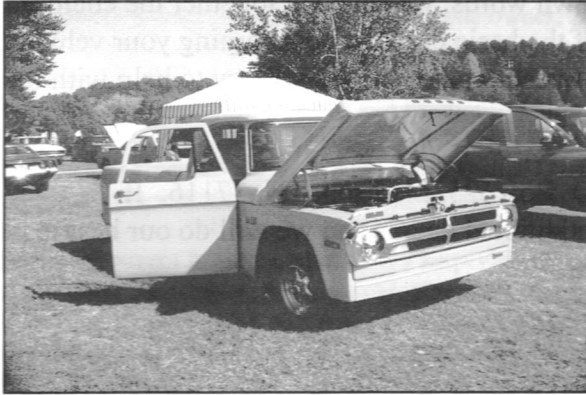
Norris Lake Mopar Show Members Choice