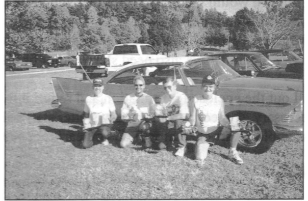
Who let these people out of jail?