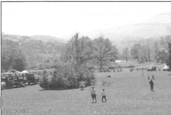
Nice Place For a Show