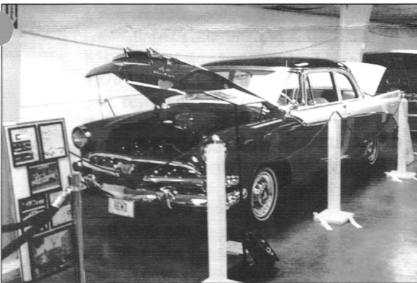
1956 Dodge Coronet