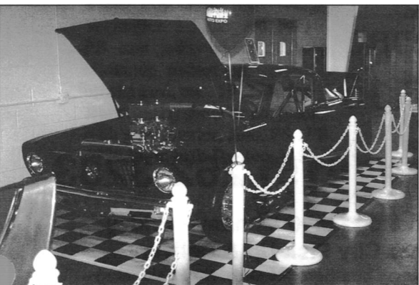
1966 Plymouth Barracuda