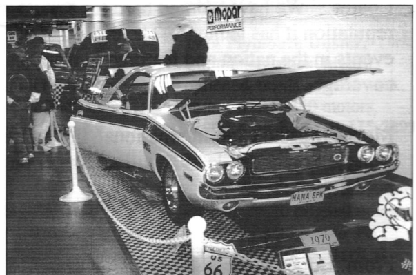
1970 Dodge Challenger T/A